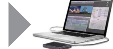
Connect this media to either your Apple MacBook Pro or Apple Mac Pro. Import the footage into Final Cut Pro. Edit. Simple.