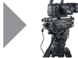
Ki Pro is post-ready production.