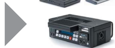
Remove the Storage Module or ExpressCard 34 media from Ki Pro.