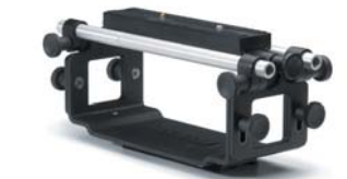
Rod Accessory kit installed on Exo-skeleton

HDMI™ HIGH DEFINITION MULTIMEDIA INTERFACE