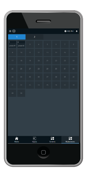
The Web RCS is compatible with any device or platform, including iOS and Android devices